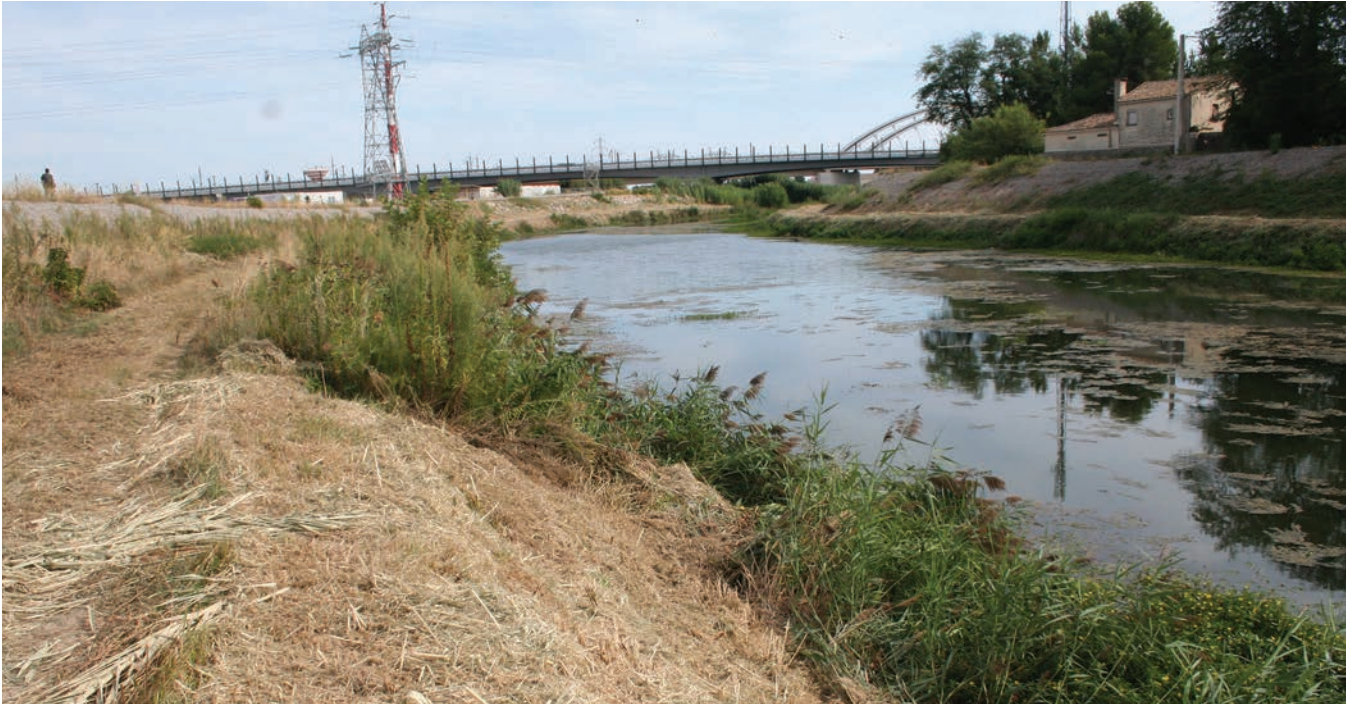
Engineered banks of the River Lez at Montpellier, France.

Coasts and estuaries, including the large estuarine delta system centered on the mouth of the Hudson River, have provided locales for the development of many of the world's largest cities and the natural resources and trade routes that support them. Coasts and estuaries are, by nature, exposed to accelerating sea level rise, storm waves, and surges intensified by climate change. All over the world we have long been building berms, wetlands, dunes, forests, breakwaters, seawalls, reefs, dikes, and other engineered features to protect coastal communities from storms. Several of these proposed or under construction in the New York City area are a reef and dune system along the south shore of Staten Island, a moveable surge barrier in Newtown Creek (Queens and Brooklyn), a seawall along the East River in lower Manhattan, and dikes in the New Jersey Meadowlands.