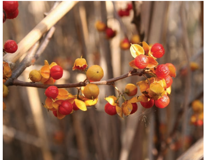
Oriental bittersweet ( Celastrus orbiculatus ) is widely dispersed by wildlife that consume the fruit. It grows rapidly and, if cut, reproduces readily from root fragments.

Timely annual removal, based on the plant’s reproductive biology, can prevent seed production or eliminate a patch. For multiflora rose, mile-a-minute, Japanese barberry, and some other perennials, an annual cutting in summer will minimize or eliminate fruit production. For the biennial garlic-mustard, twice per year removal is the most efficient: hand-pull first-year rosettes in the fall and flowering plants