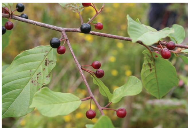
Cut stems of glossy buckthorn ( Frangula alnus ) sprout prolifically. Smothering or flame treatment or repeated cutting over several years may kill the plant.

Sometimes the right tool can make a nonchemical control project feasible. We discuss methods using some less common but efficacious