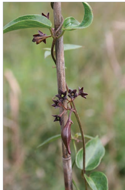
Black swallowwort ( Cynanchum louiseae ) is related to and resembles native milkweeds, but when monarch butterflies lay their eggs on swallowwort, the larvae seldom survive.

Complicating this picture is the fact that many of our forests, wetlands, and other natural communities that are protected from obvious disturbances such as logging or filling are nevertheless suffering from many less obvious ones. These include grazing and browsing from overabundant white-tailed deer, insect pests that do widespread damage to forest trees, inputs of a variety of pollutants (including atmospheric deposition of nitrogen), invasions of non-native