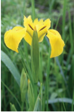
Cover photo: Yellow iris ( Iris pseudacorus ), a European species that was presumably planted for ornament in the 1800s and has spread widely in the Hudson River tidal wetlands and along tributary streams. It rarely forms dense stands in our region.